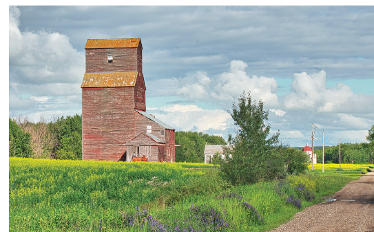
Old Saskatchewan Wheat Pool elevator in Whitkow.

Opposite: Hwy #378 northeast of The Battlefords.