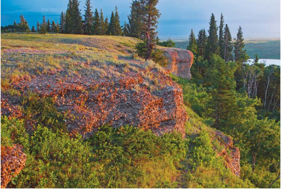
The first rays of the rising sun strike the conglomerate cliffs.

W e would be hard pressed to find a part of Saskatchewan with as many fabulous scenic viewpoints as in the Cypress Hills. This spot ranks among the best, not only in the Cypress Hills, but anywhere in Saskatchewan.