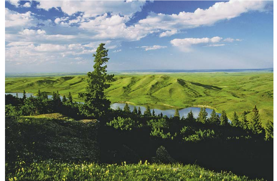
View over Adams Lake just before sunset.

slightly to the northeast, clearing the horizon over the lowest part of the terrain. When the first light shines up and floods the east-facing cliffs, the reddish rocks suddenly become saturated with a lustrous crimson glow. The magical transformation continues for the next few minutes as nuances of colour change with the rising sun.