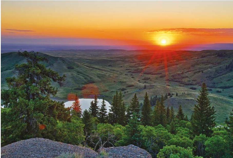
Standing on the rim of the conglomerate cliffs, you watch the sunrise over Adams Lake.