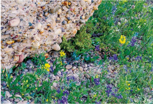
Left: Wildflowers such as low larkspur and golden bean add a splash of colour at the base of the conglomerate cliffs. Opposite: Hidden conglomerate cliffs.