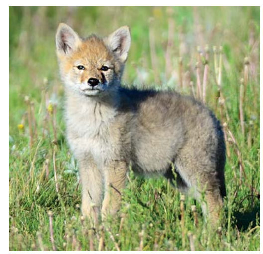
Above: Coyote pup. Opposite: Madge Lake, Duck Mountain Provincial Park.

Saskatchewan is, hands down, the sand dune capital of Canada, home to both the largest and second largest dune fields in the country, plus a few others thrown in for variety. But it's not just size that matters. The Athabasca Sand Dunes are unique in the world. Most great sand dunes are in deserts or at least arid settings. But here a desert-like terrain is seemingly misplaced in the midst of boreal