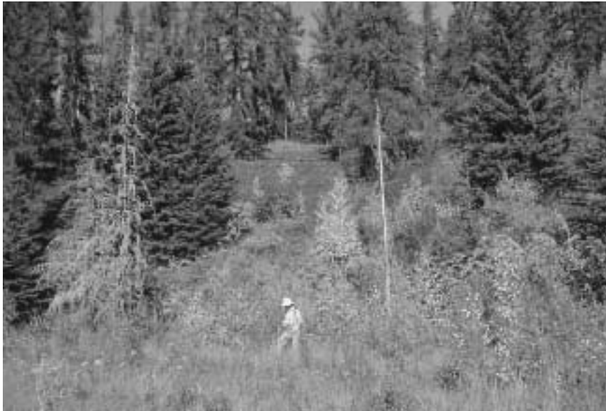
Hiking in the hills at the Gem Lakes.

Continue walking along the north side of Diamond Lake until you come to a trail leading to the right which will take you to Jade Lake. The trail becomes wider, leading to the top of a hill offering excellent views over Jade Lake and the surrounding hills. From here the path descends the hill and ends at the trailhead on Jade Lake.