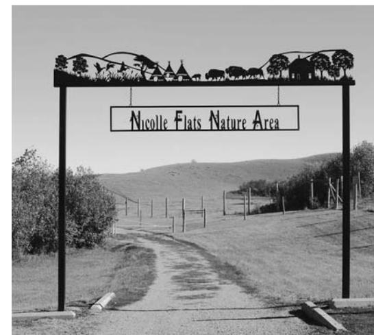
Trailhead at Nicolle Flats Nature Area.

After entering the park gate, follow the signs to Nicolle Flats, which will lead you east on a road along the south shore of Buffalo Pound Lake. Nicolle Flats Marsh is at the end of the road, with a parking area, picnic sites, toilets, and maps. Hiking here offers a combination of valley scenery with excellent chances of seeing wildlife. Ducks Unlimited Canada and other conservation agencies have done extensive work to manage the marsh by building dykes that guard it from the changing water levels of the Qu'Appelle and Moose Jaw Rivers. In the fall the marsh is a major staging area for waterfowl.