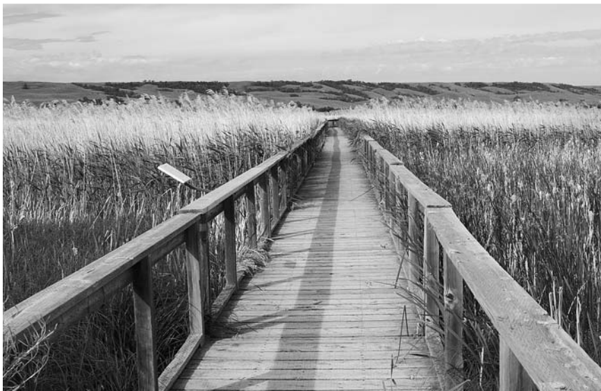
Boardwalk at Nicolle Flats Nature Area.

The trail then curves around to a bench, a great place to rest and enjoy the view after the climb. In summer, the grassy hills are covered in wildflowers such as three-flowered avens, coneflower, golden bean, purple prairie clover or pink blazingstar. You'll also see large areas of silvery wolf