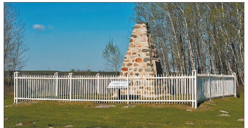
A monument and cairn at the Fort Livingstone historic site mark the North West Mounted Police's first post.