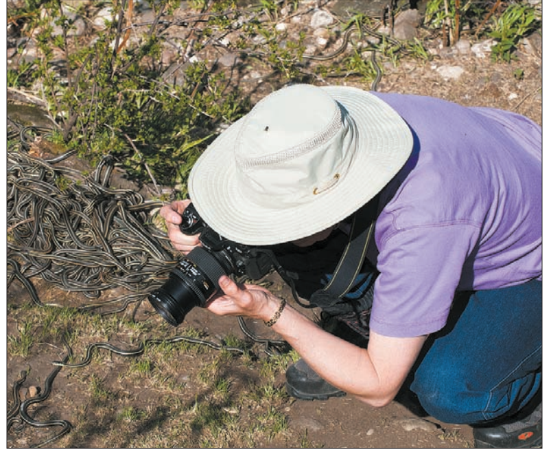
Large numbers of red-sided garter snakes are easy to find at the Fort Livingstone historic site near Pelly, Sask., in early to mid-May.