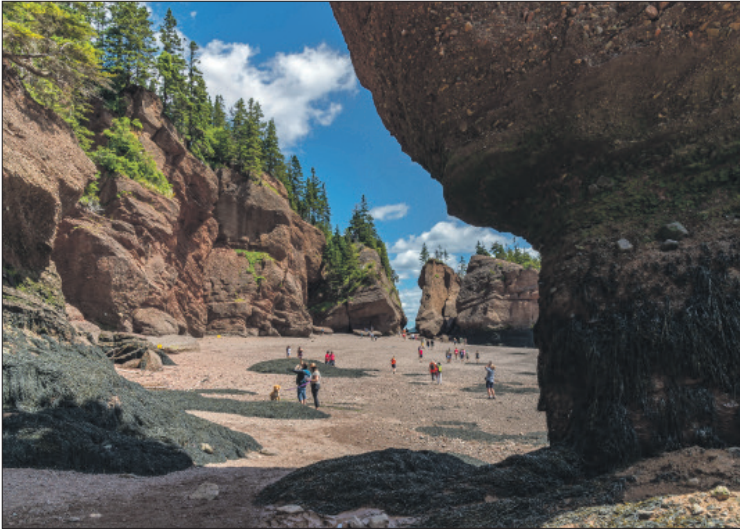
Hopewell Rocks Provincial Park is considered among New Brunswick’s top tourist attractions because of its dramatically high tides.