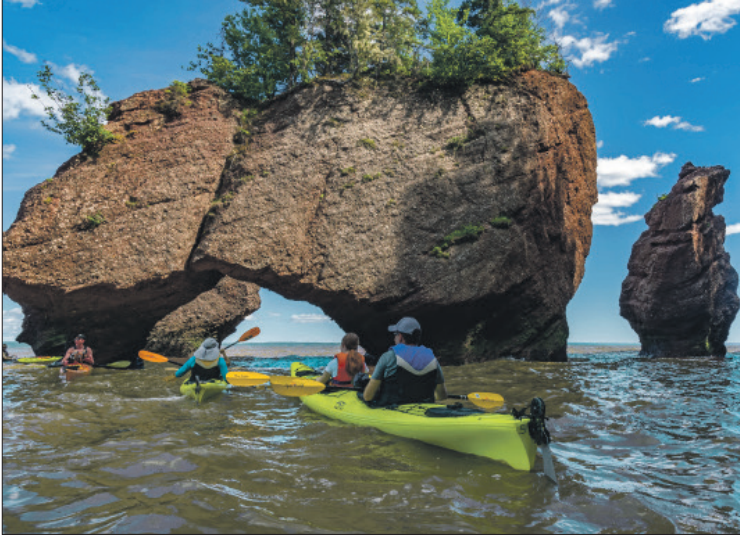
Visitors to Hopewell Rocks Provincial Park can walk on the beach at one time of day and then later return in a kayak.