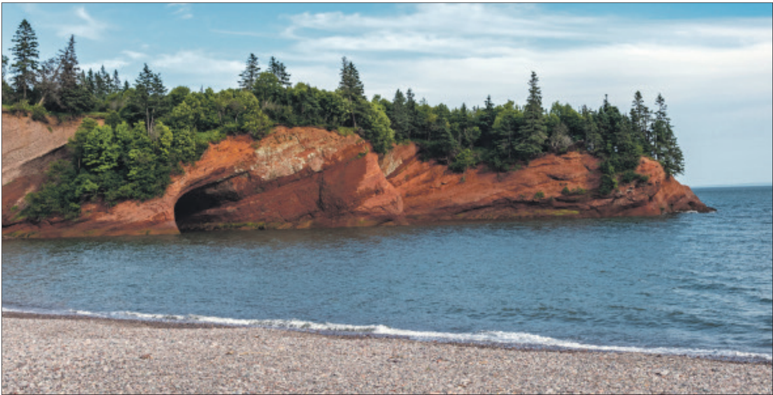
New Brunswick’s Bay of Fundy is known not only for its high tides but also its dramatic landscape.

In many places along New Brunswick’s Bay of Fundy coastline, we could visit two dramatically different landscapes in the same place on the same day. This huge body of water between New Brunswick and Nova Scotia is famous for having the highest tides in the world, so what you see now will look entirely different in six hours. The average difference between low and high tide world-wide is about one metre, while in the Bay of Fundy it’s as much as 16 metres — about the height of a five-story building. The high tides are partly due to the size of the bay, about 250 kilometres long, and its unique funnel shape. The deeper we go into the funnel, the more dramatic the tide change. Then there’s the immense volume of water that surges in and out of the bay twice a day — more than the flow of all of the world’s rivers combined. Where the coastline is shallow, we can stand at the water’s edge at high tide, then at low tide the water can be so far away that we barely see it. Near the small community of