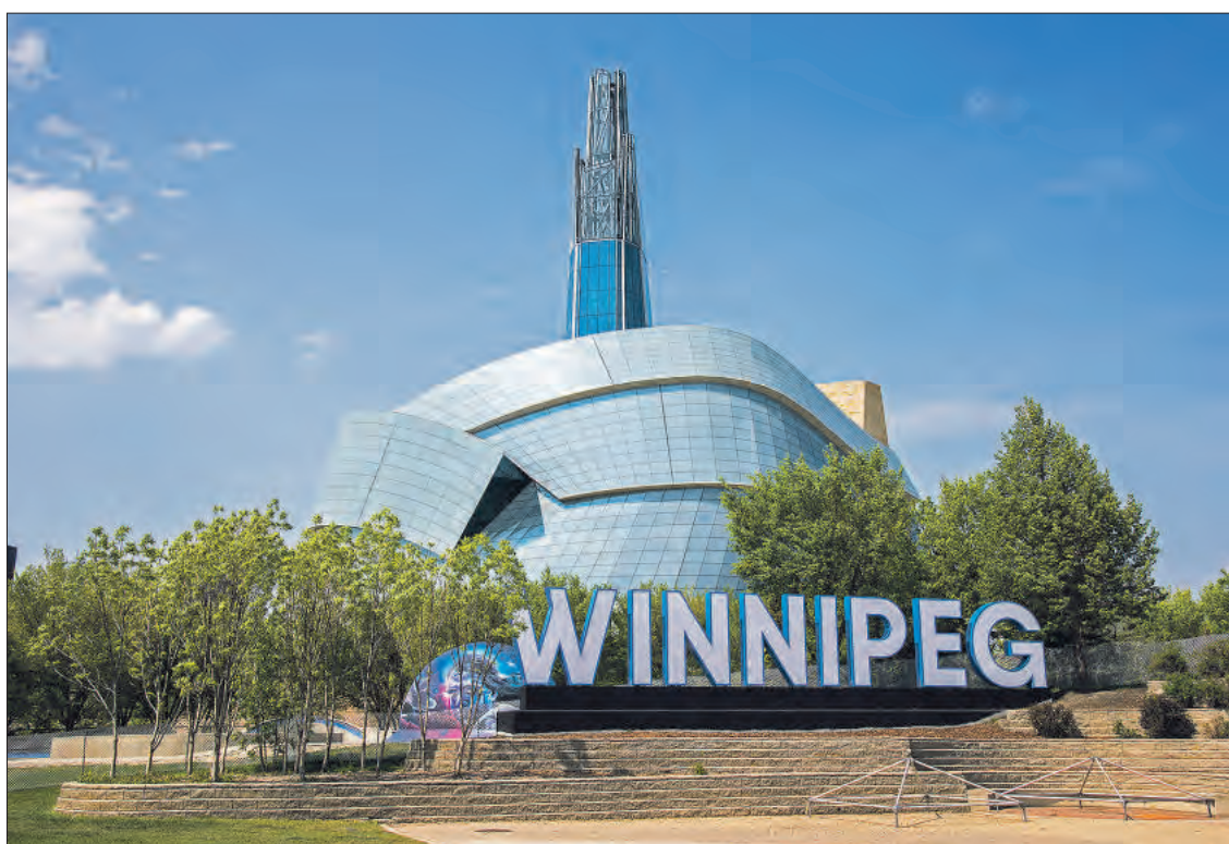
The museum boasts distinctive architecture both inside, top and out.

A large part of the museum is devoted to Canada's experience with human rights, both good and bad. Canada has been a leader in human rights legislation but has also gone through numerous negative episodes such as the expulsion of the Acadians, internment of Japanese Canadians during the Second World War and the abuse and attempted assimilation of First Nations peoples at Indian residential schools.