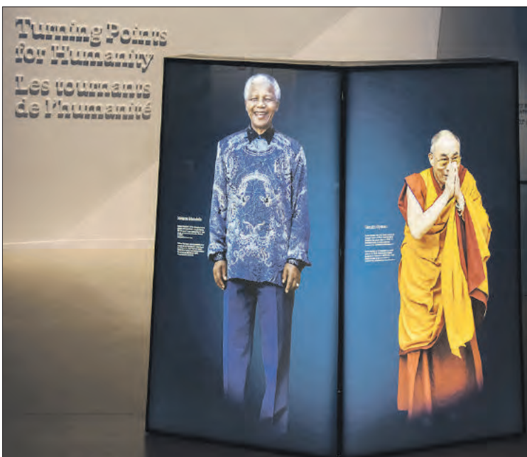
Key personalities in the struggle for human rights are highlighted.