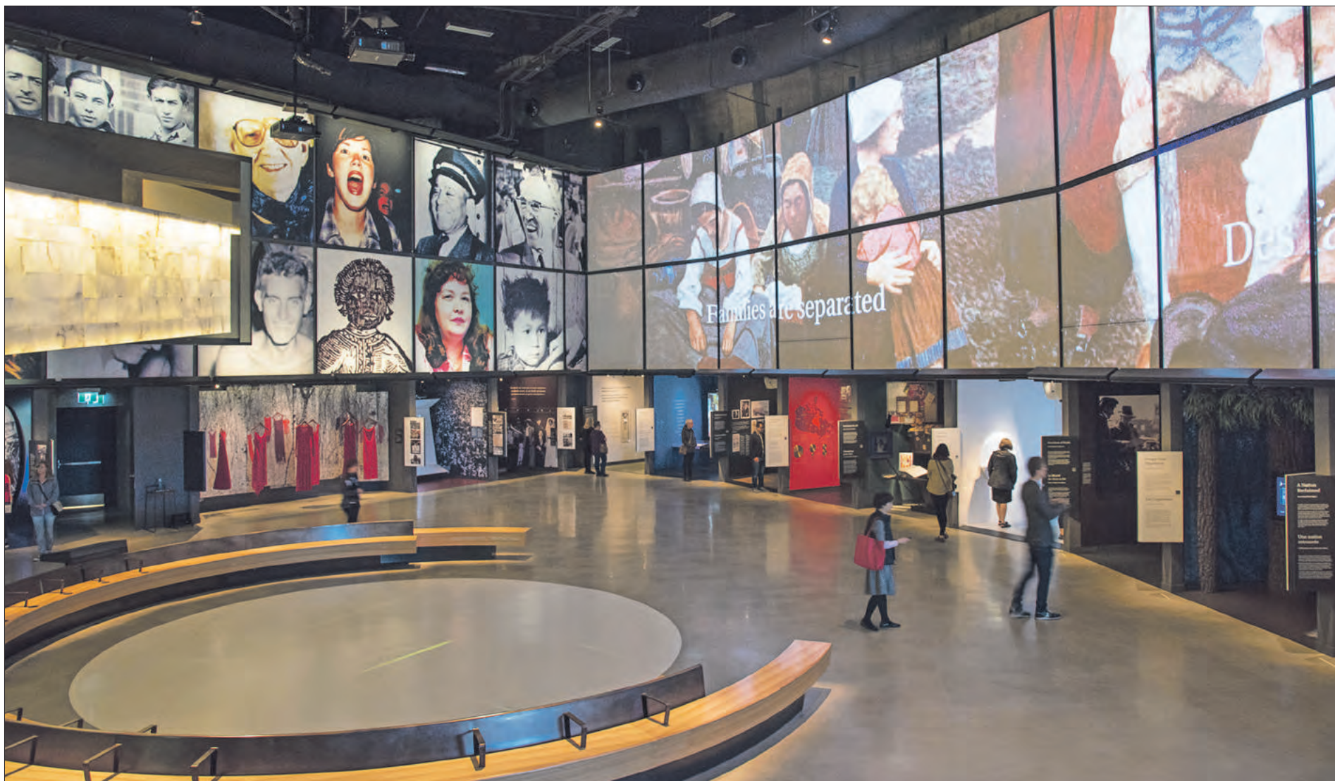
The Canadian Museum for Human Rights is the only national museum outside the National Capital Region around Ottawa.