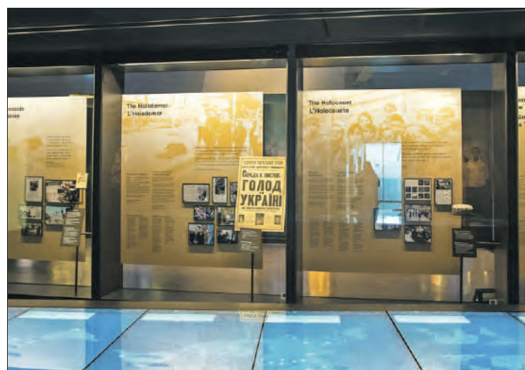
Genocide is one of the topics that the museum tackles.