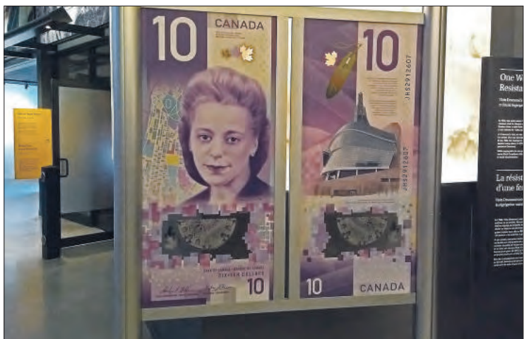
The museum appears on Canada's $10 bill along with Viola Desmond.