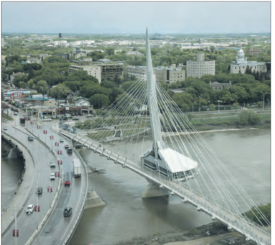
The museum's Israel Asper Tower of Hope provides sweeping views over downtown Winnipeg, left, and historic St. Boniface.

One exhibit features Viola Desmond, a black woman from Nova Scotia who was arrested because she defied discrimination by sitting in the whites-only section of a racially segregated movie theatre. The new $10 bill now features her portrait, along with the CMHR.