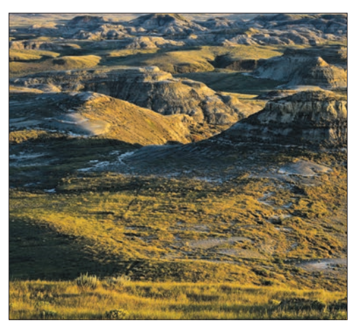
TOP LEFT: The rising sun strikes the Conglomerate Cliffs, West Block, Cypress Hills Interprovincial Park. TOP RIGHT: Backlighting just after sunrise over Castle Butte in the Big Muddy Badlands of southern Saskatchewan. BOTTOM LEFT: Walking on the active sand dunes at sunset, Great Sand Hills. MIDDLE RIGHT: 70 Mile Butte is illuminated by the setting sun at Grasslands National Park. BOTTOM RIGHT: Sunrise over the Killdeer Badlands at Grasslands National Park.

springs to life around sunrise and sunset. Pickone of many viewpoints that emphasize the sand's golden glow. To photograph the dunes, side-lighting with a low sun accentuates the ripples and textures.