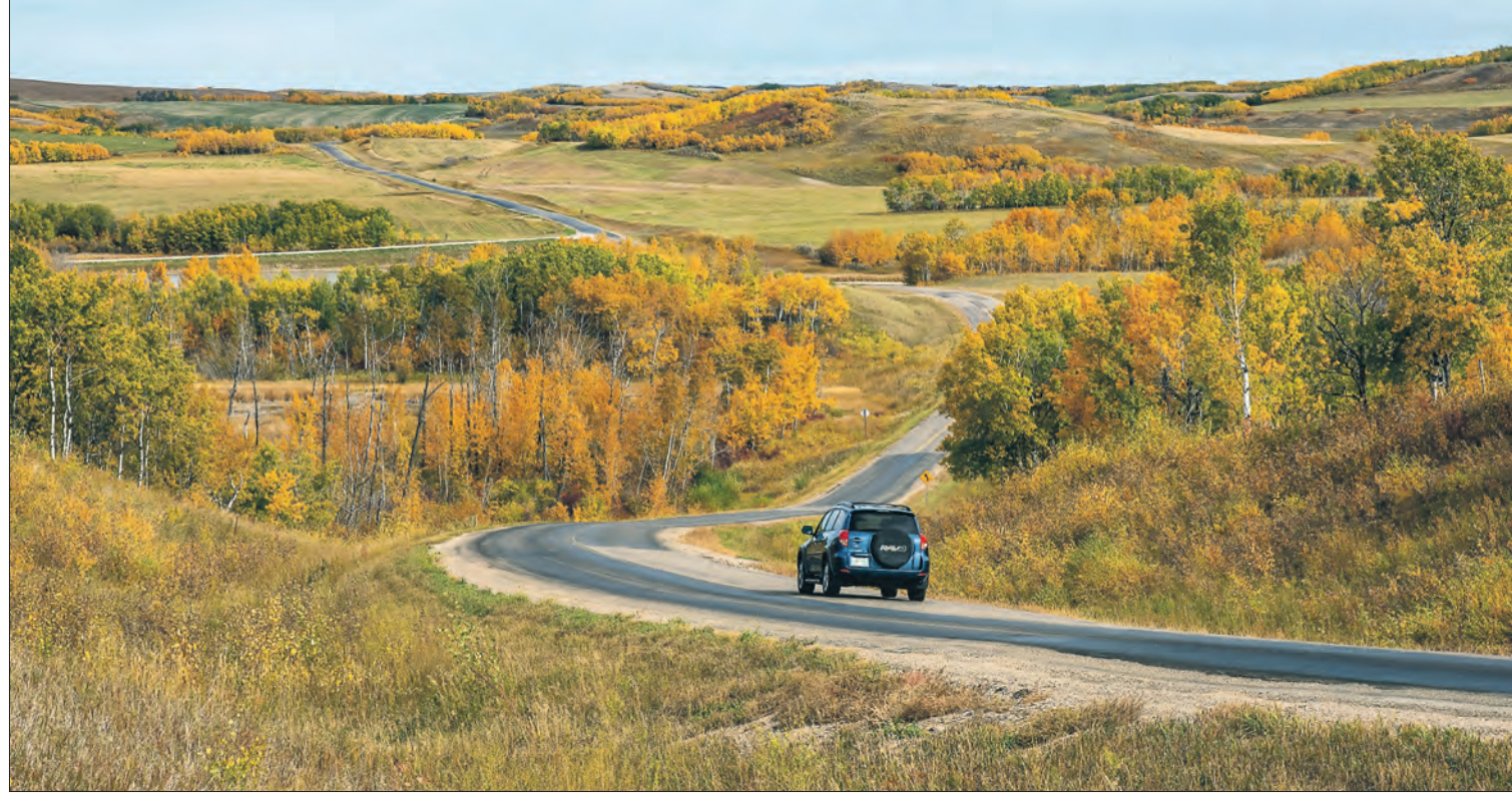
Highway 378 is one of the main roads that can be taken to explore the Thickwood Hills in northwestern Saskatchewan. It runs from just north of the Battlefords to Spiritwood.