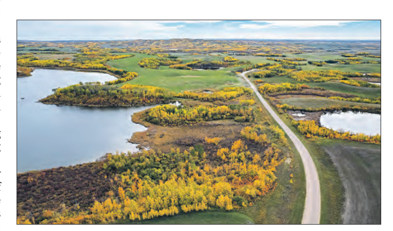
Grid Road 750 through the Thickwood Hills.

straight east of North Battleford on Highway 40, then after about 27 kilometres turn northeast on Burma Road as it descends into a valley. We can then travel by way of Alticane and Mayfair back to Highway 378 to make a loop trip. This route takes us close to the region's best-known landmark, the mysterious Crooked Bush just southwest of Alticane.