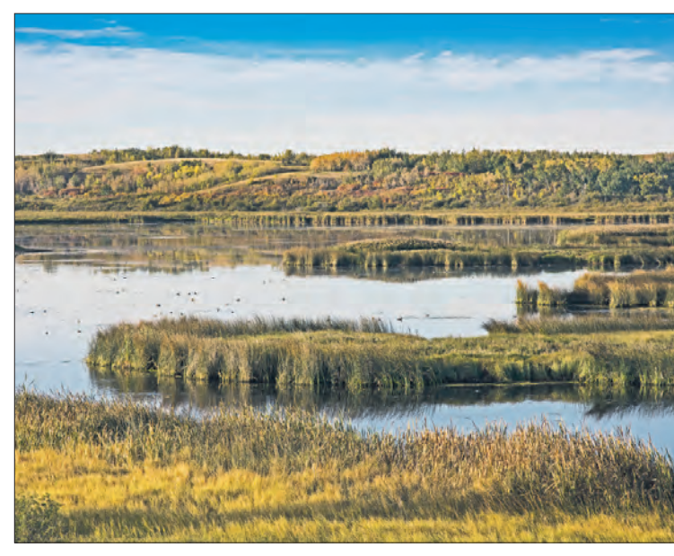
Scent Grass Lake is an important migratory bird sanctuary.