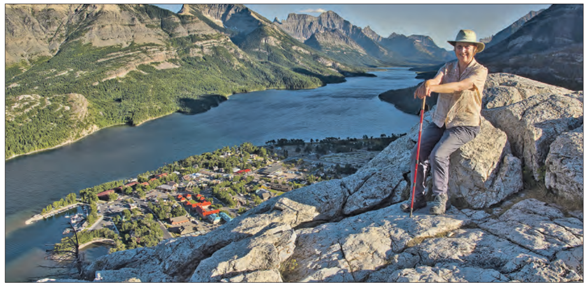
Hiking, such as in Alberta's Waterton National Park, is a good thing to do while staying close to home.

Activities such as canoeing, hiking, camping, bird-watching, boat-